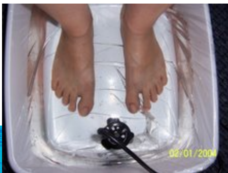
EB WATER BEFORE