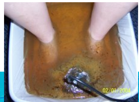
EB WATER AFTER

This technology is manufactured to ISO standards at Erchonia in McKinney Texas and is Patent Pending